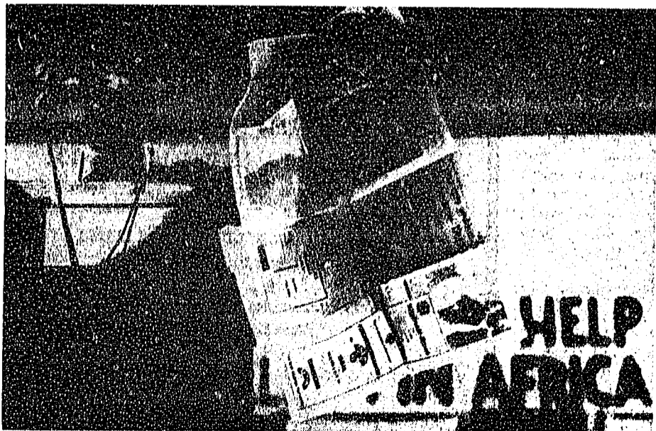
The Paper/Robert Knight