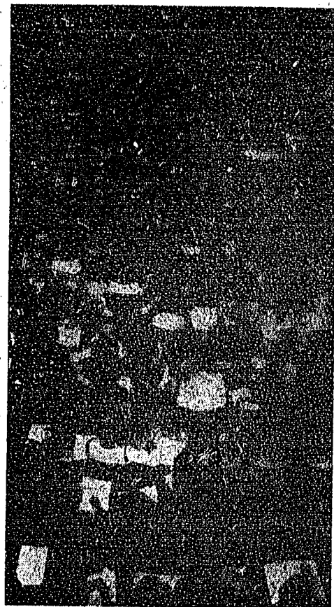
The Paper/Robert Knight